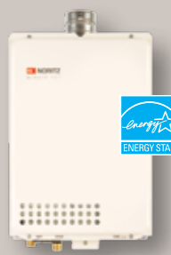
Indoor model (SV)