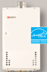
Indoor model (SV)