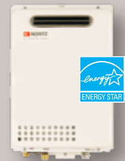
Outdoor model (OD) * Freeze Protection Kit is required for Northern climate

Ensuring an endless supply of hot water at your fingertips.